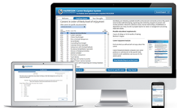
Online Interactive Career Portal